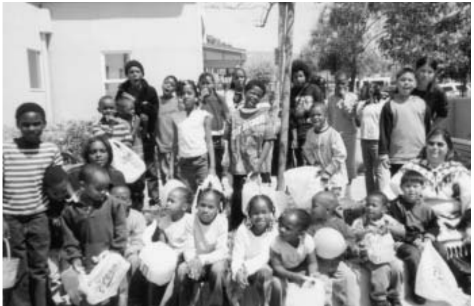
A picture is worth a thousand words. Lockwood residents' children enjoying 2003 Annual Easter Egg Hunt.

The Lockwood Gardens 2003 Annual Easter Egg Hunt held on Friday, April 19, 2003, was a HUGE success. Lockwood Gardens Resident Council sponsored this event. There were over fifty children and adults in attendance. The children were eager to find the Golden Egg and win the Grand Prize, a large chocolate bunny. There were lots of fun and games, which were enjoyed by everyone. The Lockwood Gardens Resident Council wishes to thank residents and friends that donated eggs to make this a successful event.