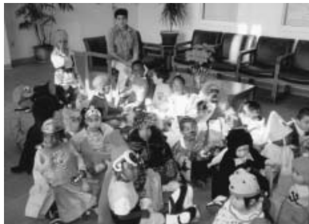
LockHaven Head Start pre-schoolers in their Halloween costumes collecting candy.

Are you aware that there is a no cost, quality pre-school located at Lockwood Gardens (1327 65th Avenue, corner of 65th and International Blvd.)? The program is called Lockhaven Head Start . The program offers a half a day option (8:30 a.m. to 12:00 noon or 1:00 p.m. to 4:30 p.m.) for children ages 3-5 years old. Services include: early childhood education, health services, free nutritious meals, services for children with disabilities, parent involvement including male involvement and many other services. Look for upcoming sign up opportunities at Lockwood Gardens in June, July and August of 2003 for the following school year (2003 – 2004.) For more information please call (510) 238-3165 .