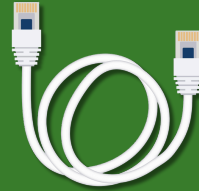
Ethernet Cable inside your resident kit